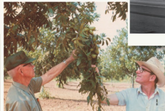
Front cover of The Pecan Quarterly magazine, 1978