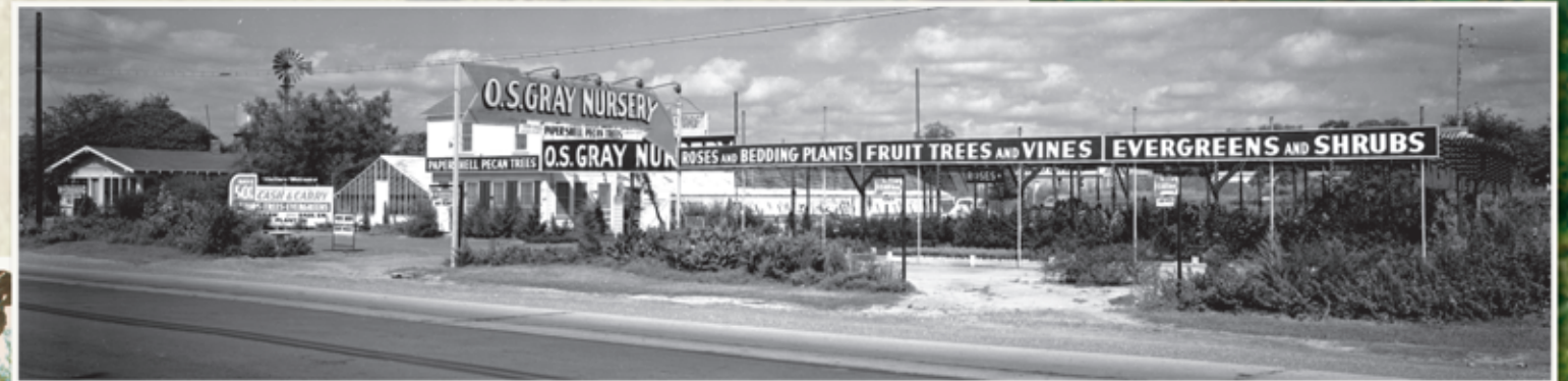
O.S. Gray Nursery, October 14, 1941