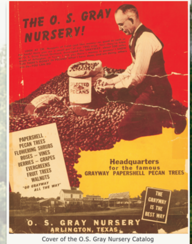
Cover of the O.S. Gray Nursery Catalog

Photos courtesy of: W.D Smith Commercial Photography Collection and Special Collections, The University of Texas at Arlington Library, Arlington, Texas.